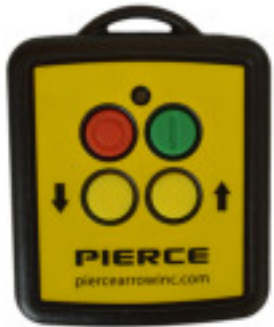
PS002 Wireless Remote transmitter