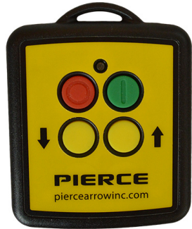
PS002 Wireless Remote transmitter