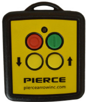
PS002 Wireless Remote transmitter