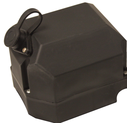
PS528N Solenoid Assembly